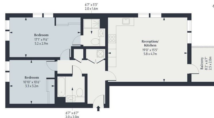
Third Floor Floor Area 778 Sq Ft - 72.28 Sq M